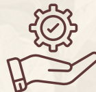
Services & Technology for Organic Production