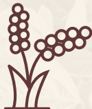
Raw & Processed Millets Products