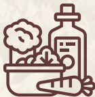
Semi-Processed Organic Products