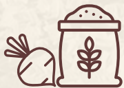
Raw Organic Ingredients