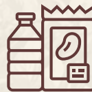
Processed Organic Foods & Beverages