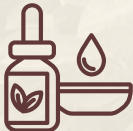
Natural Wellness & Personal Care Products