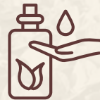
Organic Essential Products